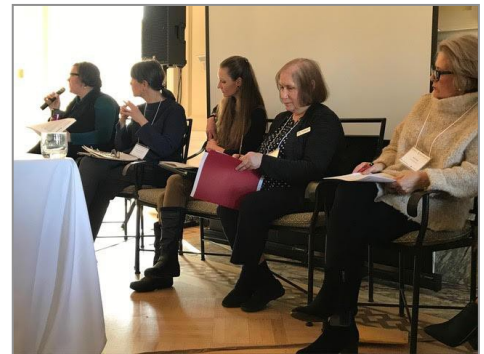
Ideas to Actions Panel

program with and for people living with dementia should be to create a sense of belonging . Another critical feature is that programs should balance "leaving the diagnosis at the door" with setting positive examples of how to live well with dementia. Gauge what people want and need at the design phase and as the program rolls out, be ready to adapt to participant needs . Lastly, in any dementia inclusive program, anticipate that participants may eventually need to transition out of the program. Consider what that transition should look like and ensure it is supportive to both the participant and the care partner.