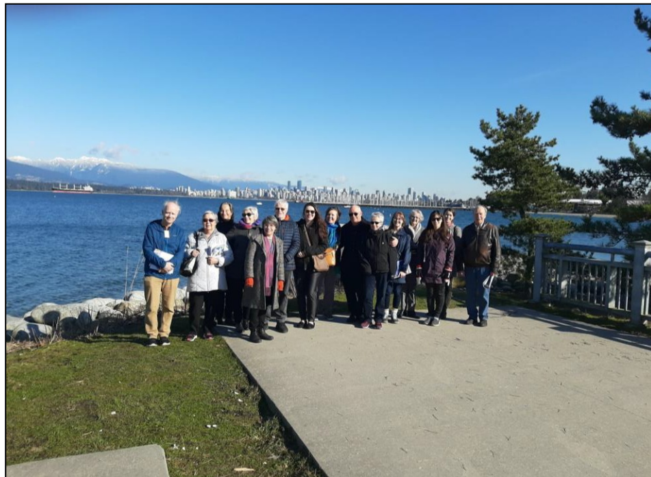
Members of the North West Dementia Working Group, West Side Seniors Hub, and Building Community Capacity research team at Jericho Beach.