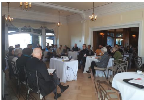
Turning Ideas into Action & Success Panel