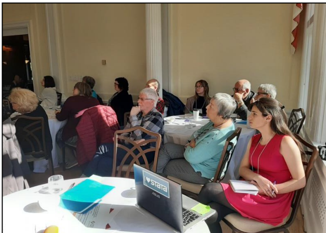
Members of the North West Dementia Working Group and the Building Community Capacity research team at Cecil Green Park House

Alison acknowledged the opportunity that the Public Health Agency of Canada funds provide. With these funds, the plan and the vision is to create durable and meaningful community investments, to evaluate the impact of those investments, and make real time adjustments, as needed. A robust evaluation will be undertaken but will be intentionally designed to align with the provider organization's context, capacity, and evaluation interests. The evaluation plan will not be a burden on organizations. Over the coming months, the research team will continue to map out an appropriate evaluation plan as community programs take shape and will continue to consult with the WSH Working Group and NWDWG on the appropriateness of the evaluation plan.