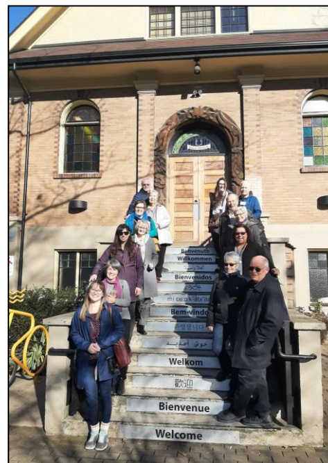
Members of the North West Dementia Working Group, West Side Seniors Hub, and Building Community Capacity research team at Kitsilano Neighborhood House